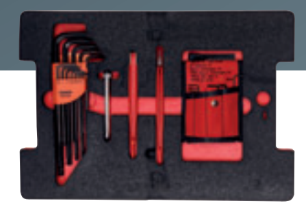
Aviation Tool Box: Additional Tray